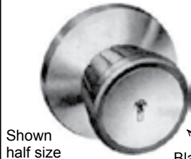
Shown half size