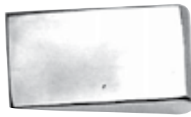
Dolly - Wedge Form, SPAENAUR No. 877-1027 - 115 x 60 mm, height 25 mm, wt. 800 g.