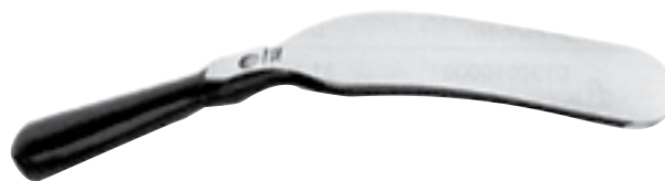
Light Inside Spoon, SPAENAUR No. 877-1034 - working face 150 mm length, 50 mm width, overall length 280 mm, wt. 750 g.