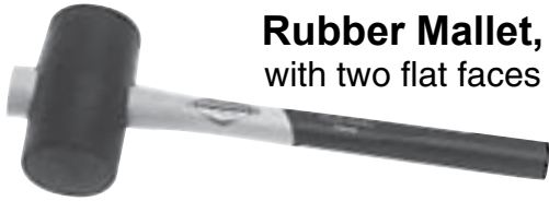
Rubber Mallet, with two flat faces