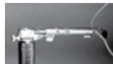
Heat Shrink Connectors