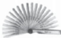
Tool Steel Plain

Stainless Steel 20 blades, pitch 0.05 mm mm-sizes = Feeler gauges, Set D, DIN 2275 Aluminum Colour