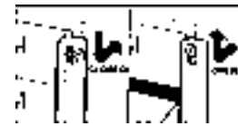
Locking Bars (used on 814-736 and 814-737, keep storage cabinet drawers securely shut.

Durham Storage Cabinets with easy-glide drawers are equipped with unique locking bars to keep the drawers securely closed while the vehicle is in motion. The 814-736 has nine drawers with adjustable dividers for maximum flexibility, and all drawers offer convenient handles. The 814-737 has a single, fixed centre divider in each drawer.