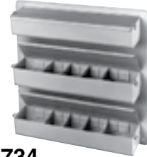
814-734 (with tray covers)

Easy-access Durham Door Trays are produced with horizontal sections; each rounded section has slots for adjustable dividers for the convenient creation of individual compartment sizes. Models 814-046 and 814-734 come with 9 dividers.