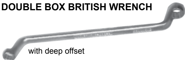
with deep offset