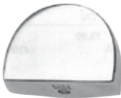
Heel Dolly, SPAENAUR No. 877-1047 - with round and flat face, length 80 mm, width 60 mm, height 35 mm, wt. 1,100 g.