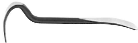
Pry and Bumping Spoon, SPAENAUR No. 877-1038 - face length 200 mm, width 60 x 40 mm, overall length 525 mm, wt. 2,150 g.