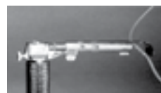
Heat Shrink Connectors