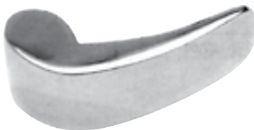
Roof Wedge (Curved Dolly) SPAENAUR No. 877-1023 - long curved face, 110 mm long, wt. 1,150 g.