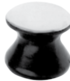
Shrinking Dolly, SPAENAUR No. 877-1048 - "Diabolo" face, diameter 60 mm, height 55 mm, wt. 850 g.