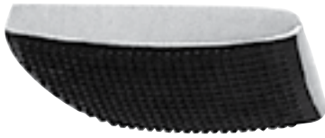
Toe Dolly, SPAENAUR No. 877-1045 - all polished, one face bowed and cross-milled for shrinking, length 120 mm, width 60 mm, height 28 mm, wt. 1,100 g.