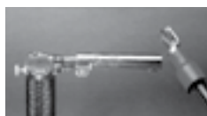
Heat Shrink Tubing