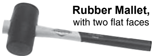
Rubber Mallet, with two flat faces