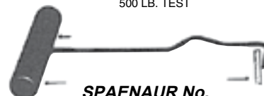
SPAENAUR No. T-200-1

Be a "metal magician." Repair quarter sections, doors, tops, etc., entirely from the outside! Super tough Pull Rods were developed as the answer to repairing today's boxed-in cars. A must for metal station wagons and panel trucks. Time saved on one job will more than pay for a complete set.