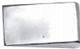
Dolly - Wedge Form, SPAENAUR No. 877-1027 - 115 x 60 mm, height 25 mm, wt. 800 g.