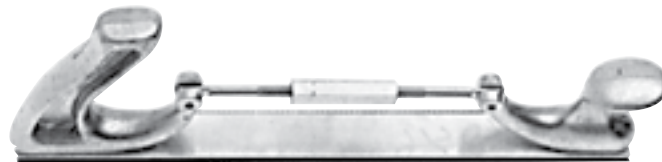
File Holder, SPAENAUR No. 877-1050 - for milled curved tooth-files, light metal, adjustable, length 350 mm, wt. 950 g.