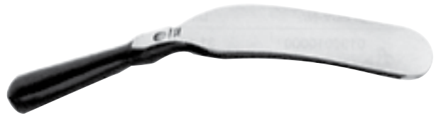
Light Inside Spoon, SPAENAUR No. 877-1034 - working face 150 mm length, 50 mm width, overall length 280 mm, wt. 750 g.