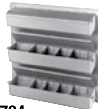
814-734 (with tray covers)

Easy-access Durham Door Trays are produced with horizontal sections; each rounded section has slots for adjustable dividers for the convenient creation of individual compartment sizes. Models 814-046 and 814-734 come with 9 dividers.