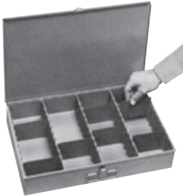
(*814-698T) (*Replacement Insert Tray available.)

814-698 Drawer with 9 Dividers Weight: 3.4 kg (7-1/2 lbs.)