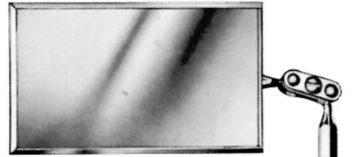
876-1536 Rectangular Telescoping Mirror 2-1/8" x 3-1/2" Overall length 11-1/4", extends to 15-1/4".