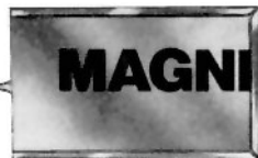
MAGNIFYING INSPECTION MIRROR

Rectangular Telescoping Mirror, extra long handle 2-1/8" x 3-1/2". Overall length 17-1/4" extends to 27-1/4".