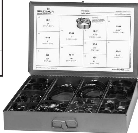
LARGE SIZE DRAWER Shipping Wt. 4.42 kg (9-3/4 lbs.)