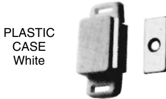
PLASTIC CASE White

096-342 40 x 19 mm Case (1.57" x 0.74") 22 x 11 mm Steel Strike (0.86" x 0.43")