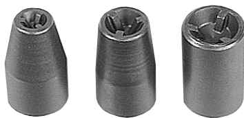
UNIT PACKAGE 1