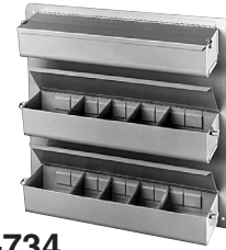
814-734 (with tray covers)

Easy-access Durham Door Trays are produced with horizontal sections; each rounded section has slots for adjustable dividers for the convenient creation of individual compartment sizes. Models 814-046 and 814-734 come with 9 dividers.