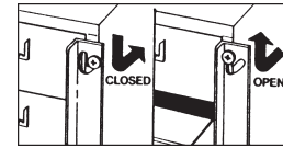
Locking Bars (used on 814-736 and 814-737, keep storage cabinet drawers securely shut.

Durham Storage Cabinets with easy-glide drawers are equipped with unique locking bars to keep the drawers securely closed while the vehicle is in motion. The 814-736 has nine drawers with adjustable dividers for maximum flexibility, and all drawers offer convenient handles. The 814-737 has a single, fixed centre divider in each drawer.