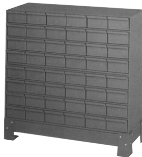
48 Drawer cabinet