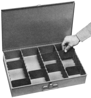
(*814-698T) (*Replacement Insert Tray available.)