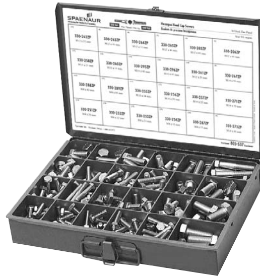
Typical "REGULAR SIZE" Assortment

(See page A3 for "Large Size" Assortments.)